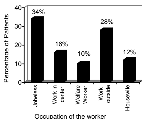
Fig. 2: Showing different occupations adopted by the Leprosy-patients.

ted by touching. Twenty six percent (13/50) thought it was divine in origin while 4% (2/50) considered it as hereditary. Sixty six percent (33/50) of the patients noticed numbness of hands as an early symptom of leprosy while 20% (10/50) noticed a discoloured skin patch. There is no vertical transmission of the disease as answered by 94% (47/50). Forty percent (35/50) of the leprosy patients did not have proper knowledge about leprosy before the occurrence of disease in them. Forty-six percent (23/50) said that it is a communicable disease. Leprosy is curable stated by 46% (23/50) of the patients. Seventy-six percent (38/50) said that leprosy causes deformity.